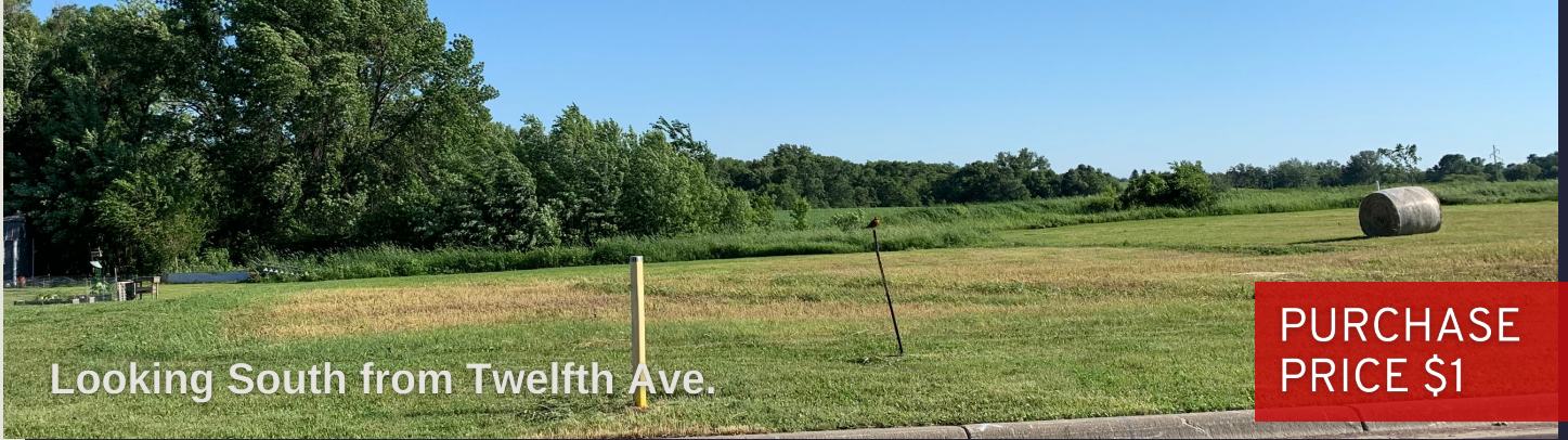
Looking South from Twelfth Ave.