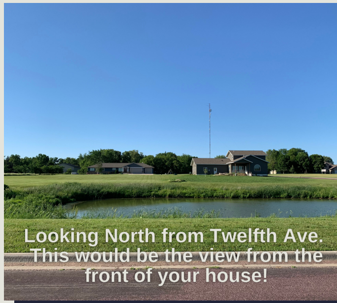
Looking North from Twelfth Ave. This would be the view from the front of your house!