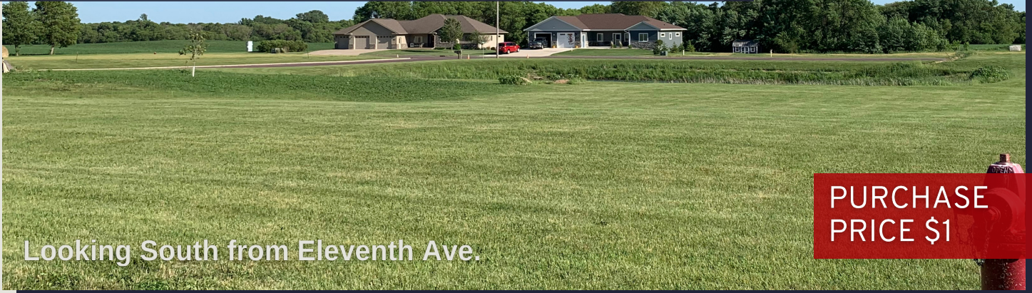
Looking South from Eleventh Ave.